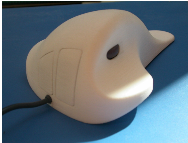
Fig. 4 Front view of the Horse manufactured by means of RPT with touch switches and scroll wheel

Figure 4 shows the front view of the Horse with touch switches and scroll wheel.